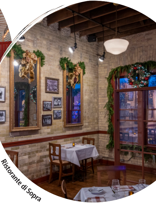
Ristorante di Sopra